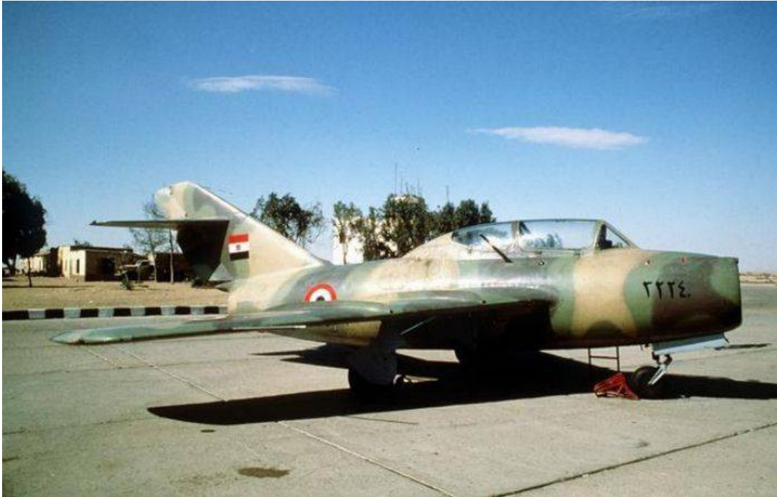
Illustration 3: Russian designed and built, MIG-15 fighter jets were state of the art aircraft at the time of the Czech arms deal. Seen above is an Egyptian Air Force MIG-15 parked on a runway in 1981.