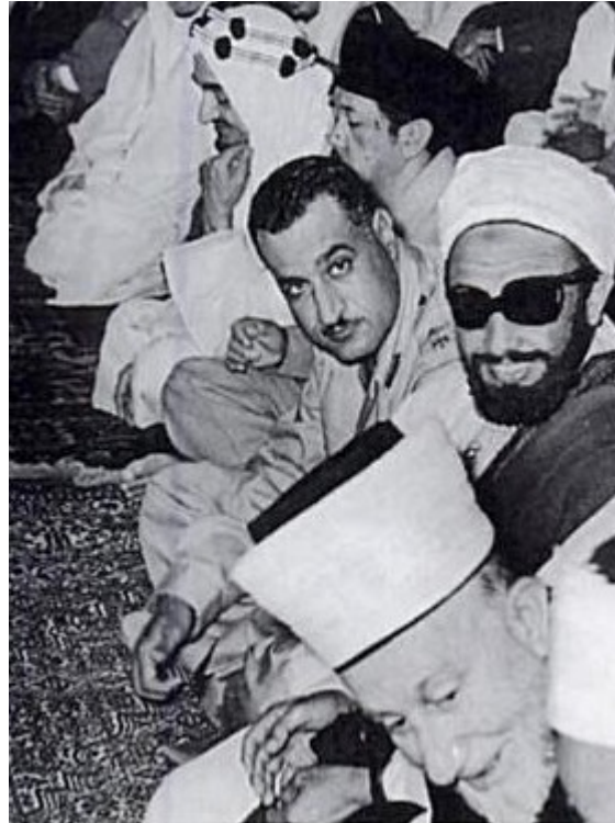
Illustration 2: Nasser photographed at the Bandung Conference surrounded by other Middle Eastern heads of state. By the end of the conference, Nasser had become an international leader of the Non-Aligned movement (from Said's Nasser , page 154).