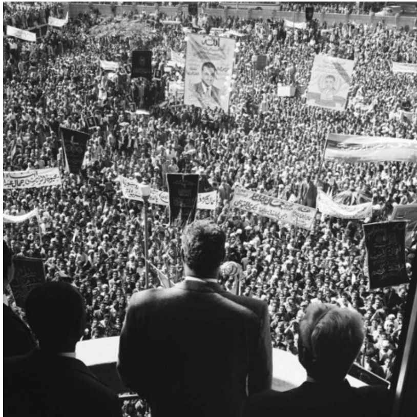
Illustration 4: Nasser giving a speech to the Egyptian people declaring the political merger of Syria and Egypt into the United Arab Republic, February 1, 1958. Courtesy of the Library of Alexandria photo archives, photo taken February 1, 1958.